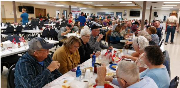
Sverdrup Lodge's annual Lutefisk Dinner was held on October 19th. Everyone enjoyed the "really good" lutefisk.